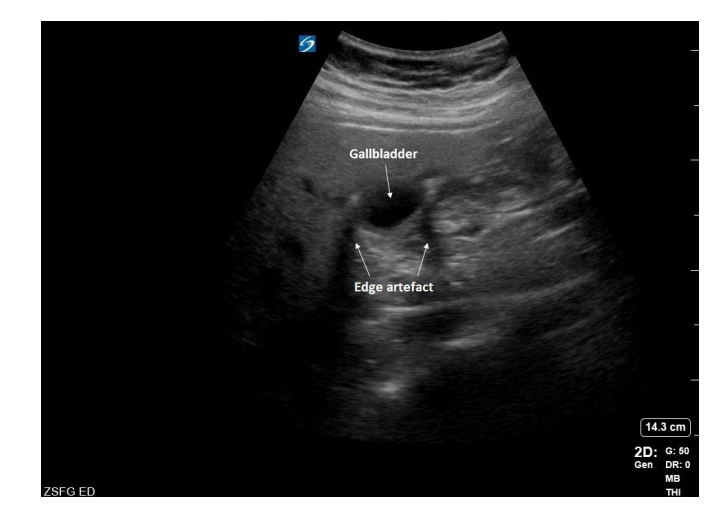
Figure 2 Transverse view of gallbladder with edge artefact, a thin, linear shadowing phenomenon that can occur at the margins of curved structures.

A complete RUQ POCUS includes assessing for (1) the presence of gallstones, identified as hyperechoic or bright white structures with acoustic shadow (an absence of echogenicity deep to the hyperechoic structure); (2) enlargement of the gallbladder, defined as >10 cm by 4 cm; (3) anterior gallbladder wall thickening (>3 mm); (4) pericholecystic fluid, which appear as anechoic or hypoechoic regions surrounding the gallbladder, most commonly along the anterior wall abutting the hepatic