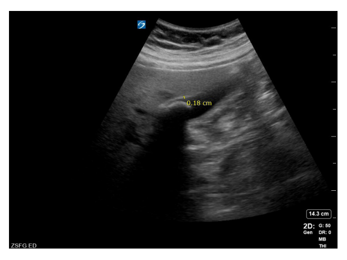
Figure 3 Still image showing a normal measurement, 0.18 cm, of the anterior gallbladder wall. The anterior gallbladder wall is defined as thickened if measuring >0.3 cm.

A large gallstone, with a hyperechoic surface and acoustic shadowing deep to the stone, was identified at the gallbladder neck (figure 1). The gallbladder wall was not thickened (figure 3).