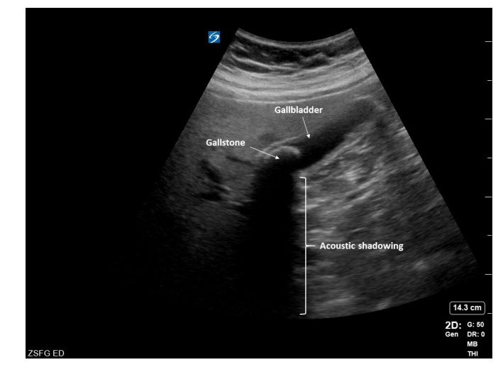
Figure 1 Longitudinal view of the gallbladder from the neck through the fundus of the gallbladder revealing a large stone near the gallbladder neck with associated acoustic shadowing below.

1. Subcostal sweep : place the probe in a sagittal fashion (probe marker towards the patient's head) and sweep along the right subcostal margin. It may be helpful to begin at the right flank, identifying the liver and right kidney, and sweep medially and cephalad until the gallbladder comes into view. Alternatively, it may be helpful to start at the epigastrium, identifying the inferior edge of the liver and sweeping laterally until the gallbladder comes into view.