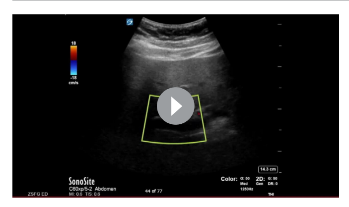
Video 1 Common bile duct visualised above the portal vein with Doppler confirmation, with the hepatic artery also in view.

parenchyma; (5) common bile duct dilation (usually >7 mm) and (6) a sonographic Murphy's sign, defined as the maximal point of tenderness with the probe pressing over the visualised gallbladder.<sup>4-6</sup>